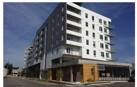
Focus on transit-oriented development - Denver, CO

29 STATIONS OVER 17 MILES EARLIEST CONSTRUCTION DATE 2023