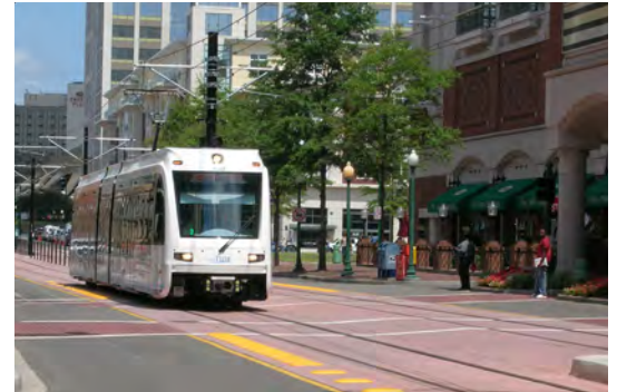
On-street running tracks - Norfolk, VA