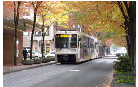
Stations part of neighborhood - Portland, OR