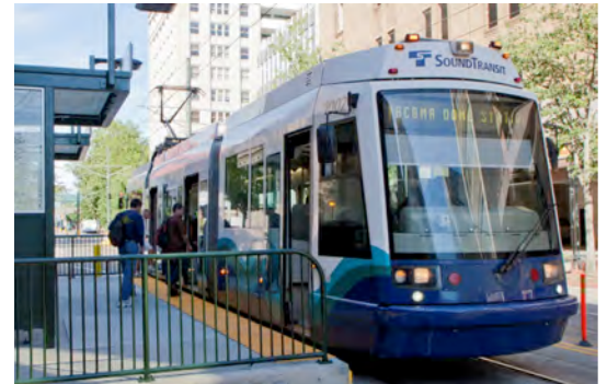
Low-floor vehicles - Seattle, WA